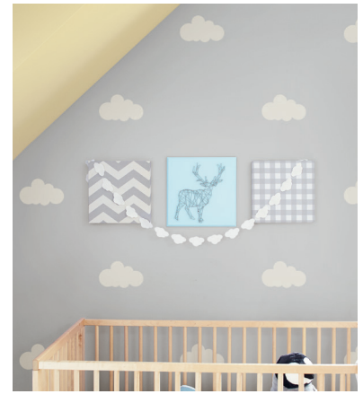
Wall: Fair-Minded Gray 438-3DB Clouds: White Linen 007W Build-out: White Whimsy 218-1DB

Use Dutch Boy® paint to ensure precise color match. Refer to the actual color chip for accurate color representation.