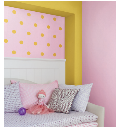
Walls: Reagan's Tu-Tu 147-2DB

Use Dutch Boy® paint to ensure precise color match. Refer to the actual color chip for accurate color representation.