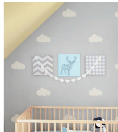
Wall: Fair-Minded Gray 438-3DB Clouds: White Linen 007W Build-out: White Whimsy 218-1DB