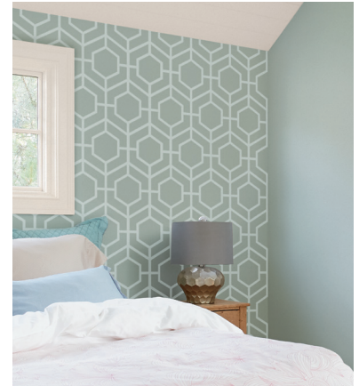
Stencil: Coastal Mist 427-1DB Stencil Basecoat: Cooled Breeze 136-1DB Trim: Pebble Shores 408-1DB

Use Dutch Boy® paint to ensure precise color match. Refer to the actual color chip for accurate color representation.