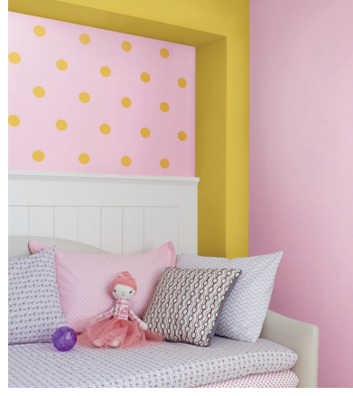
Walls: Reagan's Tu-Tu 147-2DB Polka Dots and Build-out: Tamale Husk 219-5DB